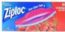
Gallon Ziploc Bags