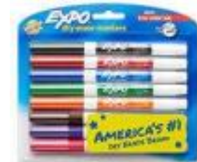
Fine Point Dry Erase Markers